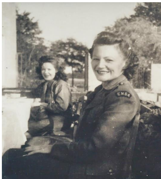
Ivy Benson in ENSA uniform WW2

Ivy Benson ran her All Woman Orchestra throughout the Second World War.